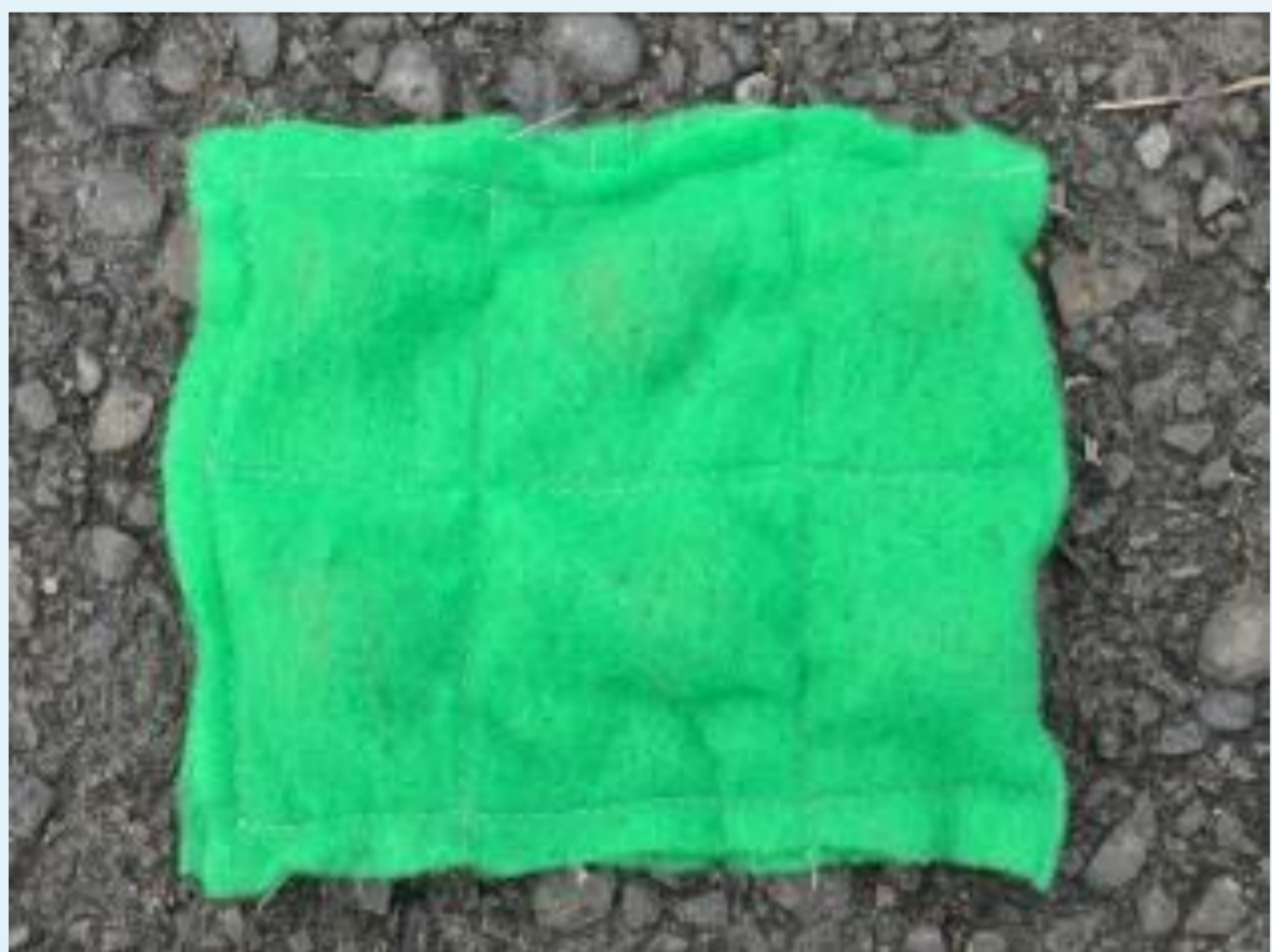
Erosion Control Blanket (ECB)

Vegetation pellets, composed of soil, fertilizer, fibers, and seeds, enhance seed protection and establishment under stress and can be applied in landslide areas. Geomats are widely used for slope stabilization and erosion control. In this study, pellets were combined with five geomats to form pellet-net packages (15 × 10 cm, six pellets per package). Drop and germination tests were conducted to evaluate their feasibility for landslide revegetation.