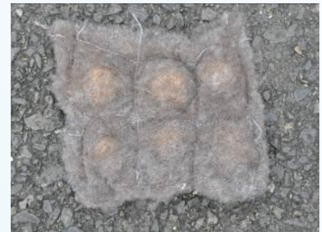
Vegetation Takino Filter (VTF)