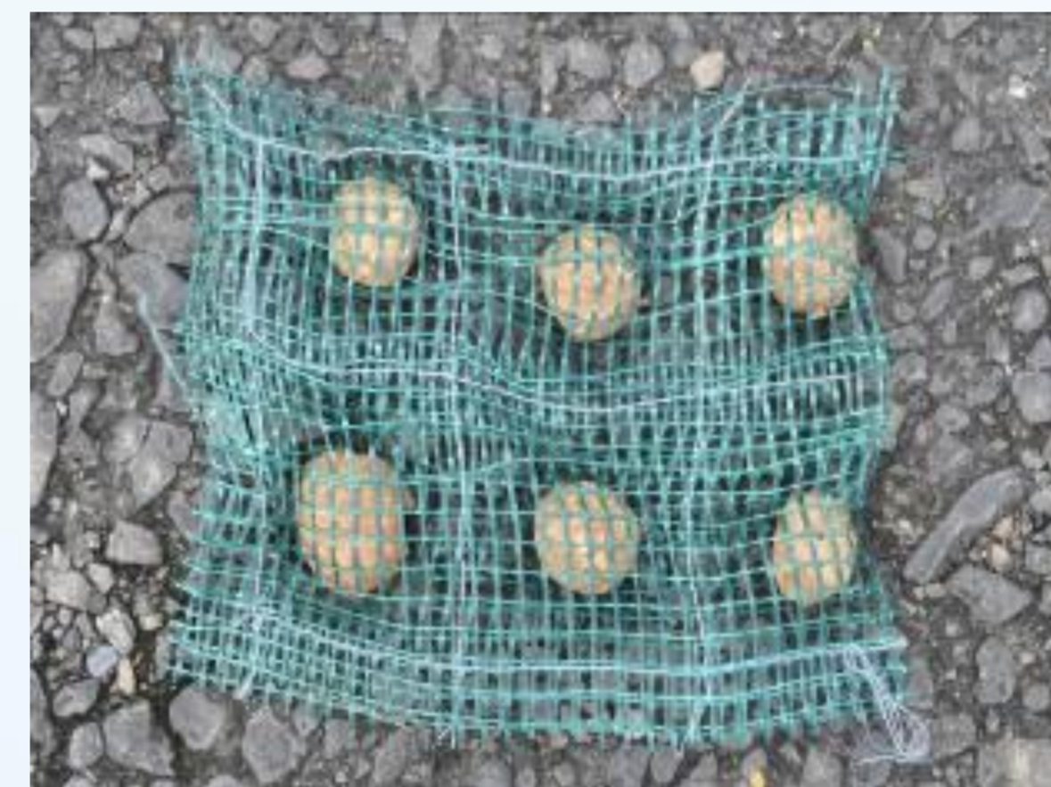
Polyester Mesh Geomat (PET)