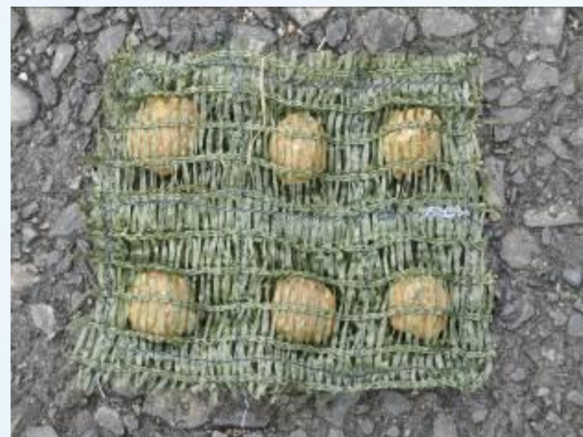
HDPE Shade Net (HDPE)