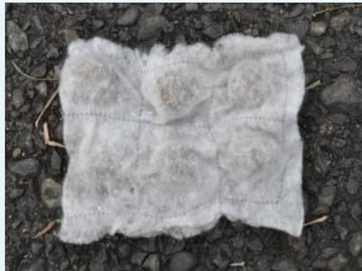
Cotton Erosion Blanket (CEB)